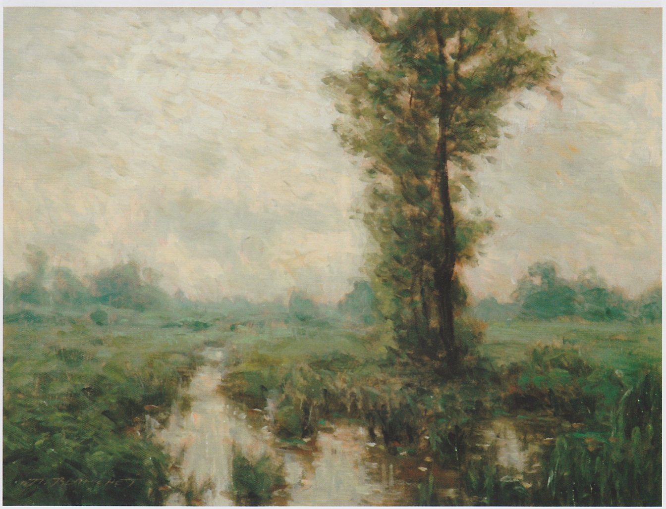
"MATINÉE", oil, 2007, 12 x 16 in.