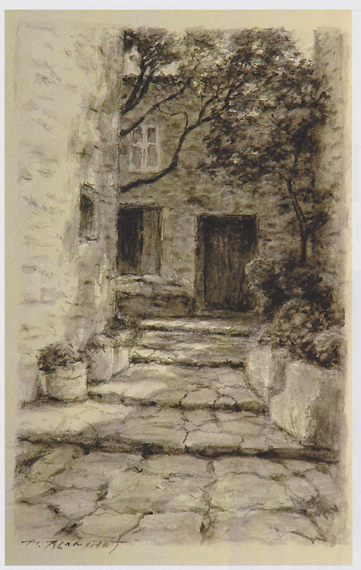
"SOUTH OF FRANCE SCENE/Scène du midi", pencil and watercolour, 2007, 8 x 5 in.

participated in many exhibitions, several of them in France, and had won prizes and received honourable mentions.