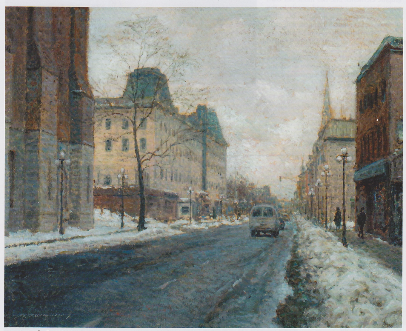
\mbox{\ensuremath{\text{\tiny W}}} SUSSEX DRIVE", oil, 2007, 24 x 30 in.