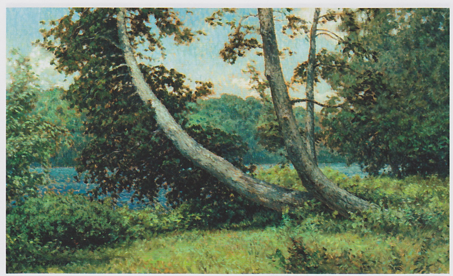
"MASTERS OF THE SHORES/Maîtres des rives", oil, 2007, 30 x 50 in.

transcribe the drawings onto canvases while the spontaneity of the creative moment still lives. He is able to transcribe up to three sketches in the same session. Later he refines the images by adjusting the lighting or adding details.